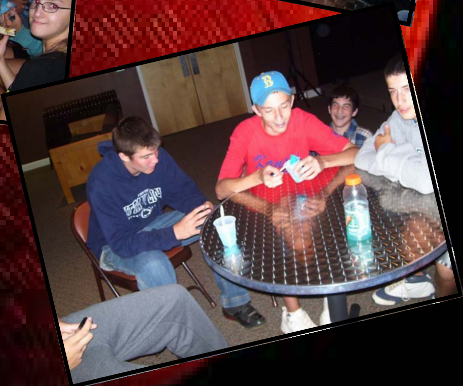
Hanging out after the tournament